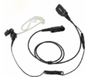
Detachable Earpiece with Transparent Acoustic Tube EHN22