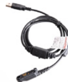
Programming Cable (USB Port) PC45