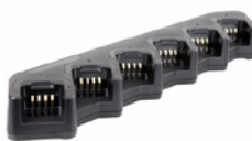
MCU Multi-Unit Charger (for Thick Battery) MCA08